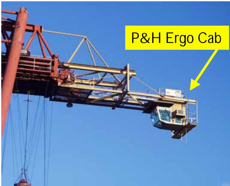
P&H Ergo Cab

Bulletin no. 13404 2 of 2 New: Feb. 14, 2000 Rev. 0