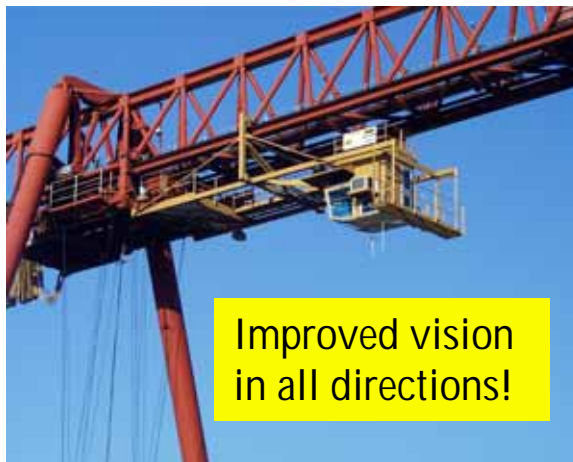
Improved vision in all directions!