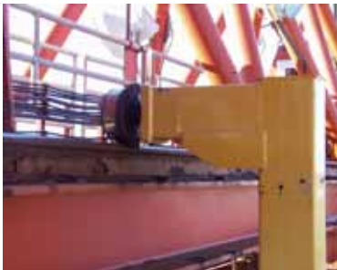
Idler support wheel