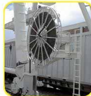
Heavy Duty Cable Guide