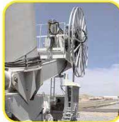
Galvanized Steel Reel Spool