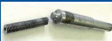
"Will-Fit" Catastrophic Failures – Brake Stud (left) & Hoist Gear (right)

The firm hired by a paper maker to overhaul a hoist used "Will-Fit" gears in the hoist gear case, which failed after 12 months. The hoist was repaired once again using "Will-Fit" parts, which failed in less than 6 months. Post repair analysis of the parts revealed that they did not meet specified tolerances.