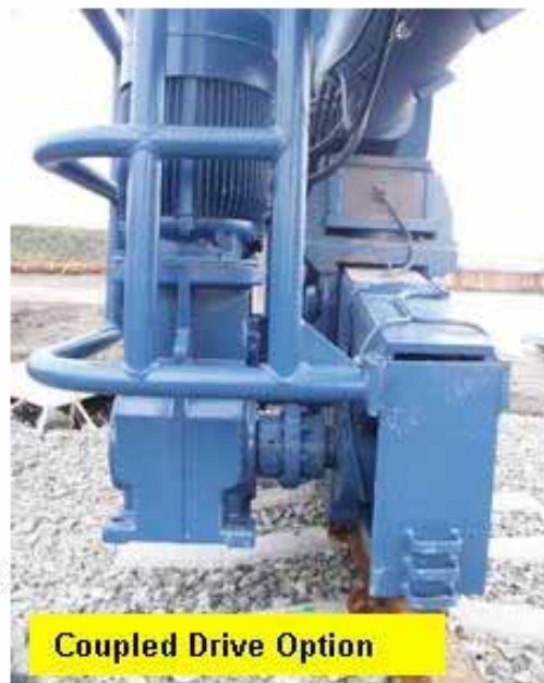
Coupled Drive Option