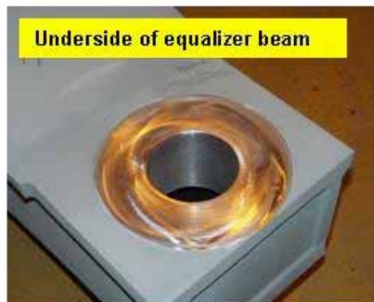
Underside of equalizer beam