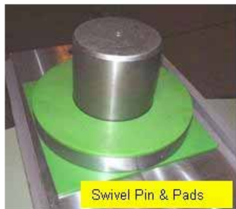
Swivel Pin & Pads

TECHNICAL DATA SHEET SWIVEL EQUALIZER CONVERSION PORTAL CRANE