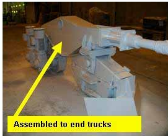
Assembled to end trucks