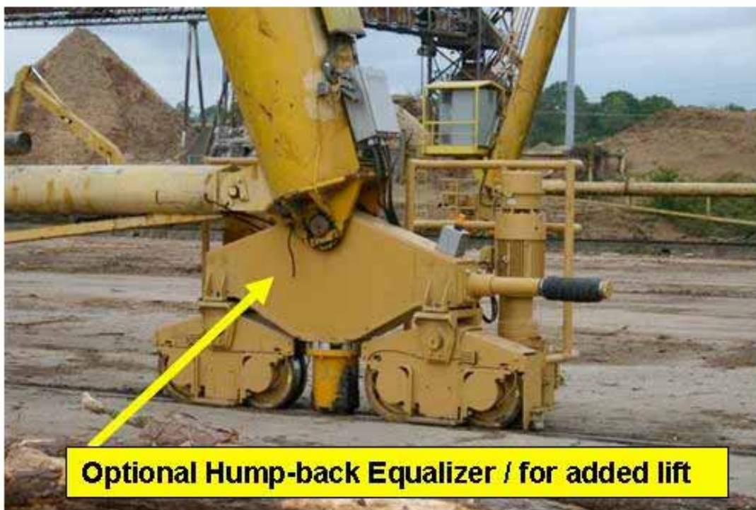
Optional Hump-back Equalizer / for added lift

TECHNICAL DATA SHEET SWIVEL EQUALIZER CONVERSION PORTAL CRANE